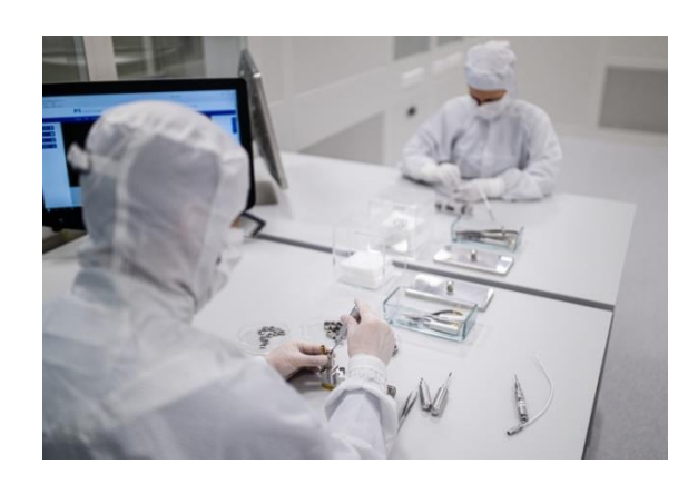
Abb. 1 Manufacturing space in ISO class 5 cleanroom at PI Karlsruhe