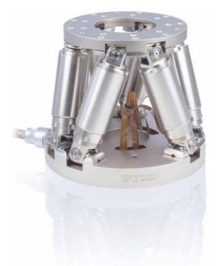
Fig. 3 The compact Hexapod is available in a version for vacuum environment of up to 10^{-6} hPa

An example of a particularly compact Hexapod, which has been tested and proven, for example, also in high-vacuum applications, is the H-811 (Fig. 3).