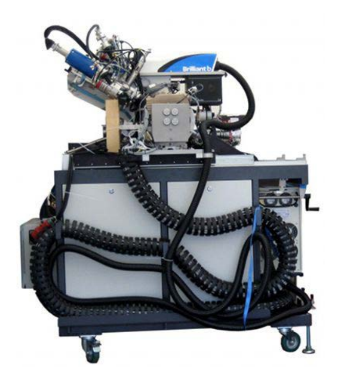
Fig. 4 New beamline PLD system for in-situ synchrotron diffraction (Image: SURFACE)

For direct use in such a beamline, SURFACE has now developed a new all-in-one system, which impresses in particular with its compact design (Fig. 4) and has already been tested and proven in a first project, offering scientific and commercial users the opportunity to further develop innovative technologies.