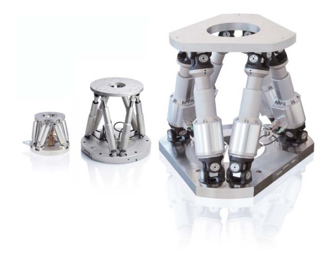
Fig. 1 Depending on design, Hexapods can position loads ranging from a few kilograms to a few hundred kilograms or even to several tons in any desired orientation in space at high precision

Hexapods allow individual positioning in all six axes. Their parallel-kinematic structure is considerably more compact and stiffer than that of serially stacked multi-axis systems. Moreover, there is no accumulation of guiding errors and tilt errors of the individual axes. The pivot point can be selected as desired via software commands and remains independent of the motion.