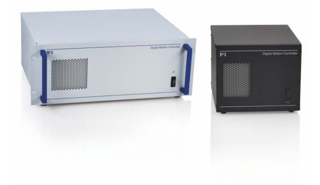
Fig. 2 Powerful digital controller with open software architecture

Depending on the application requirements, they are driven by high-precision drive screws and precisely controllable DC motors or directly by linear motors, e.g. based on piezo actuators. Matching digital controllers (Fig. 2) and extensive software support make it easy for the user to solve each positioning task without great effort.